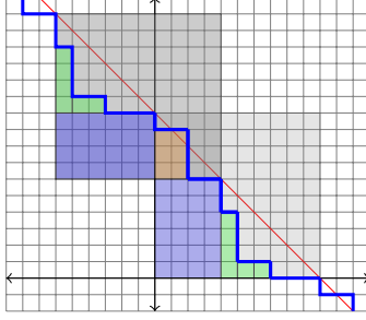
FIGURE 3. Path corresponding to \lambda = (7, 5, 5, 5, 4, 4, 2, 2, 2, 0) .

On the other hand, since our assumption is that \text{sort} \circ \text{shift}^j(\lambda) is also dominated by \delta_n , we obtain