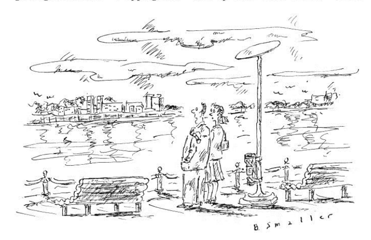
"To me, the Hudson is much more than a river—it's a moat."